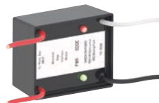
INTERFACE 002 (sold separately)