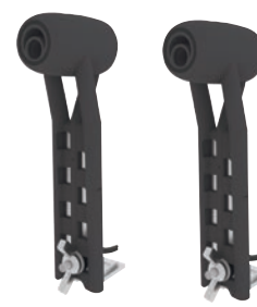
PHOTO061 Photoelectric Cells N4X