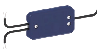
INTERFACE003 Y-Connecting Signal-Merging N4 Module