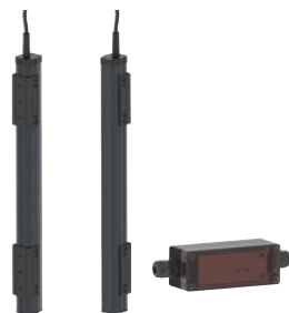
LIGHTCURTAIN004 Non-Monitored Light Curtain 6' (1.8 m) Protection Height