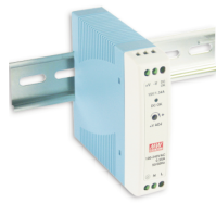
POWERBLOCK 006 24Vdc 1 Amp Power Supply