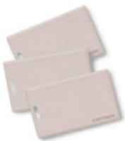
CARDREADER 018 Access Card (Reinforced) 3.4"L x 1.2"W x 0.1"D

Compatible Accessories (Sold Separately) ▶▶▶